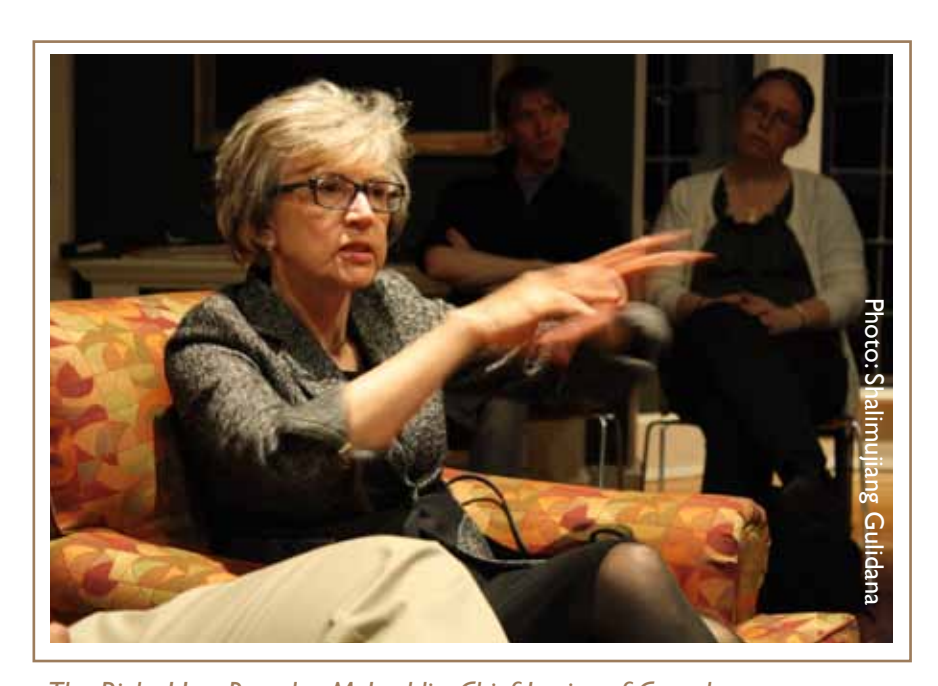
The Right Hon. Beverley McLachlin, Chief Justice of Canada