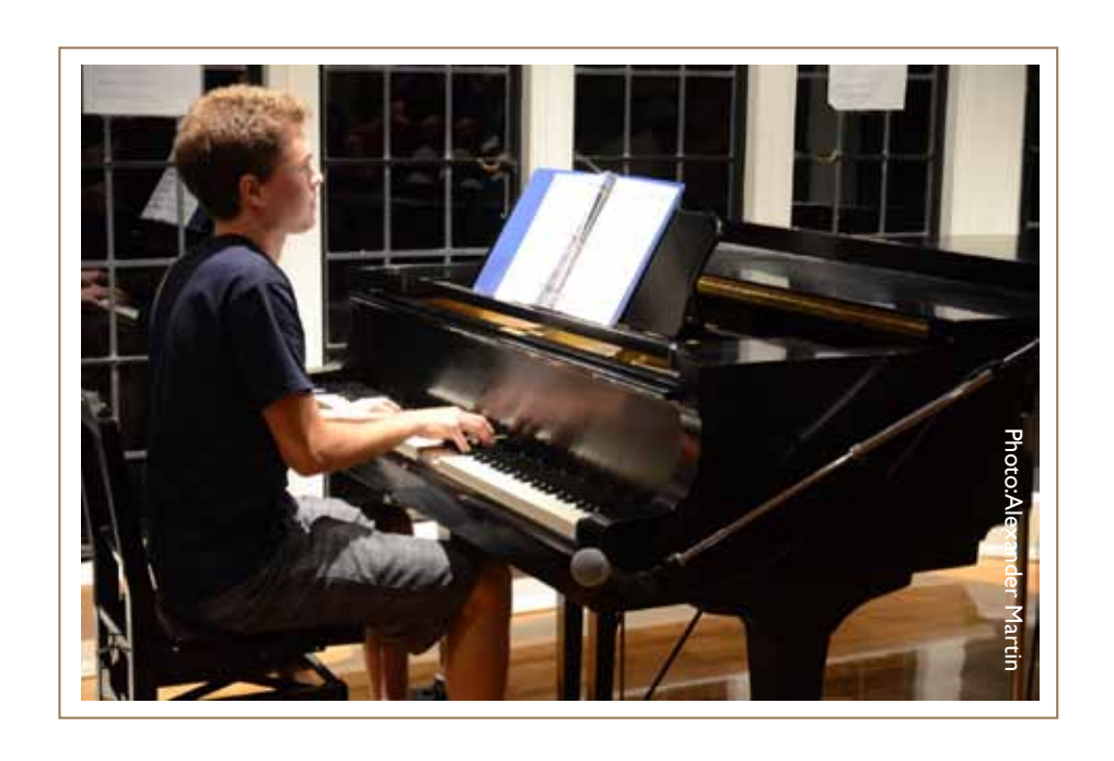
Coffee Houses hosted by the Arts Committee