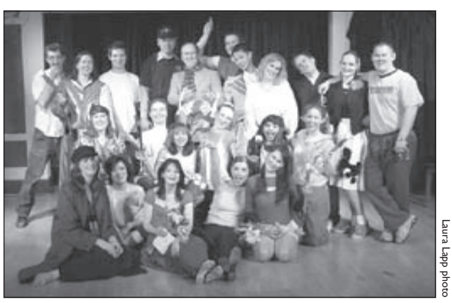
A Broadway Musical Review ensemble