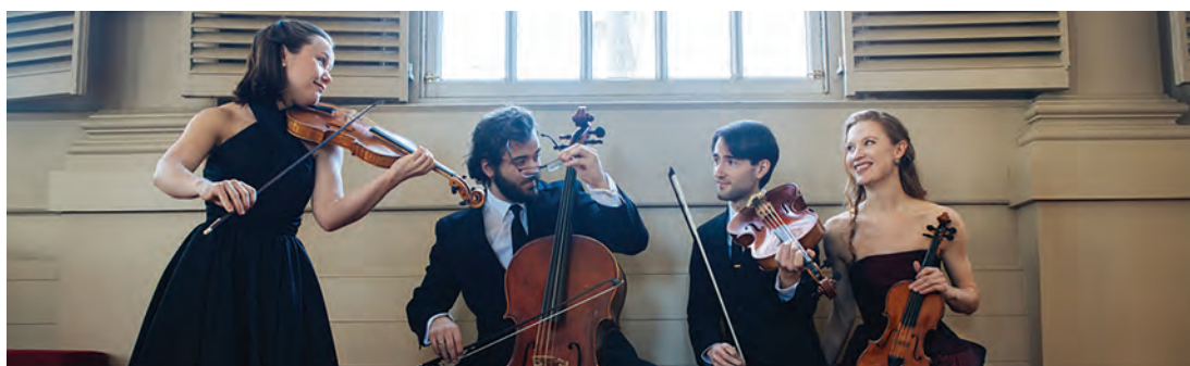
Diderot String Quartet