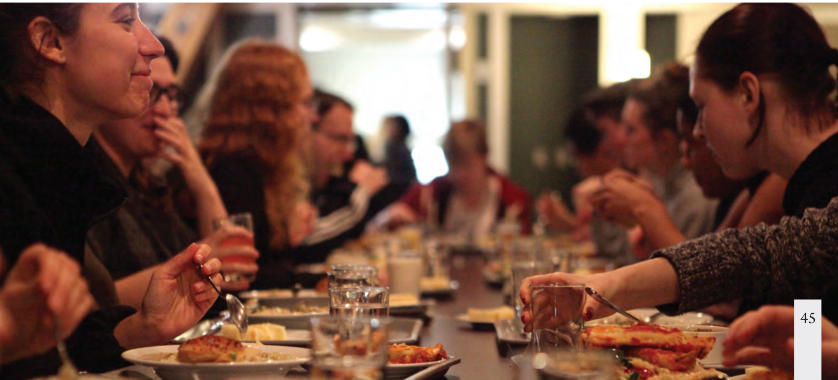
Dinner in the Great Hall