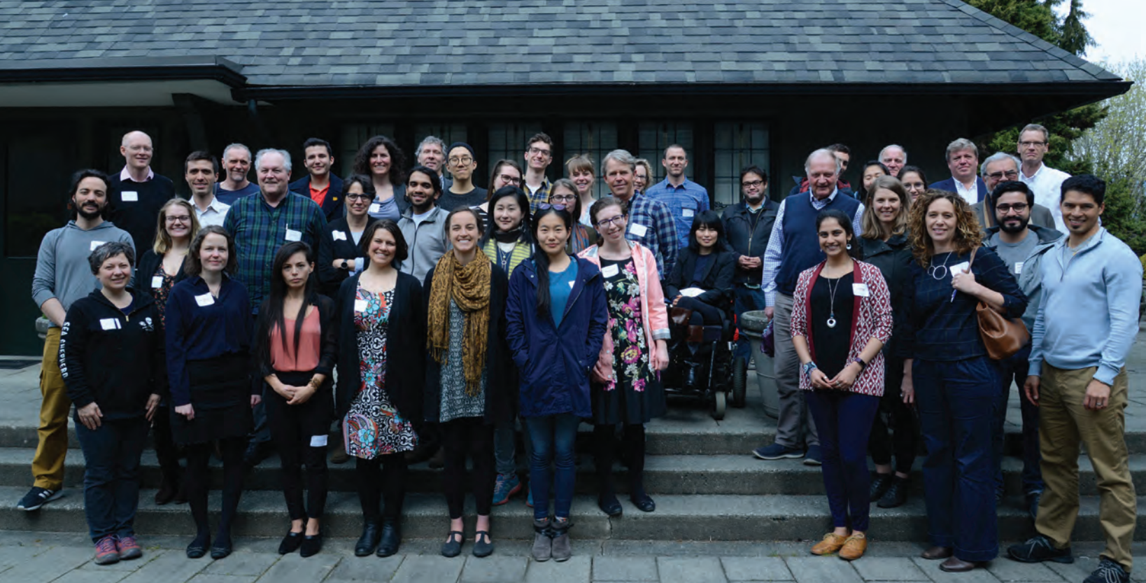
Hope in the Anthropocene Workshop participants, on the steps of Green Commons

Most immediately, Founders' Dinner is a chance for us to recognize outstanding—truly, founding —contributions made by current Resident Members (see p. 47 below for the William C. Gibson Citations ).