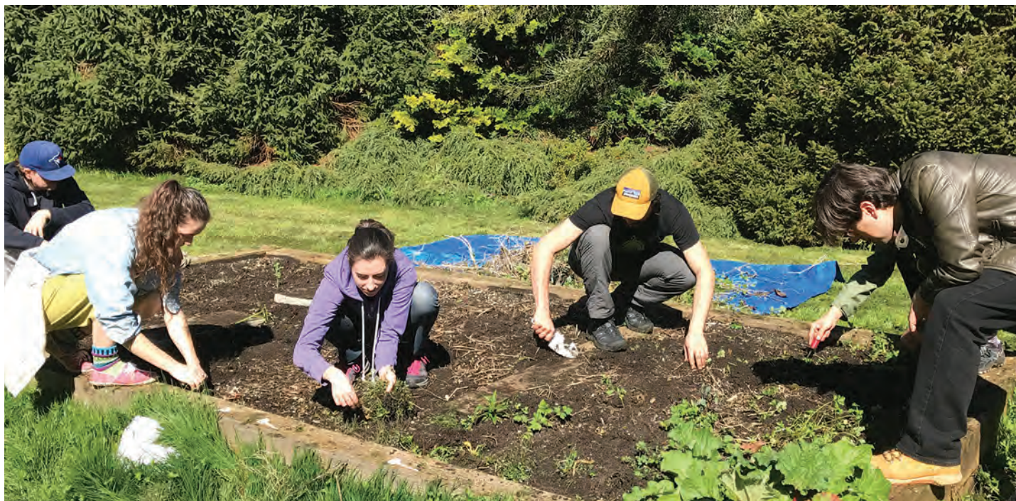
Resident Members tending the garden