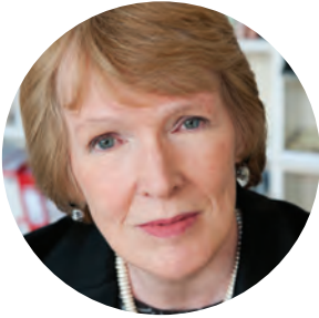
Margaret MacMillan History, University of Toronto